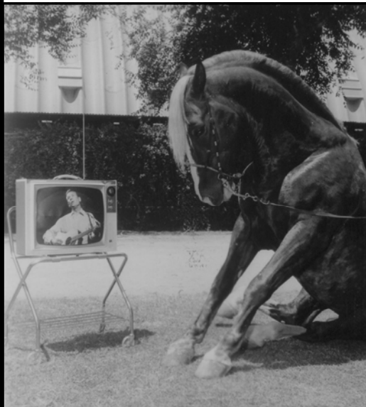
KoKo Watching his favorite cowboy on TV